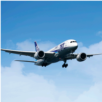
Photo by Kentaro IEMOTO, is freely licensed work, as explained in the Definition of Free Cultural Works.